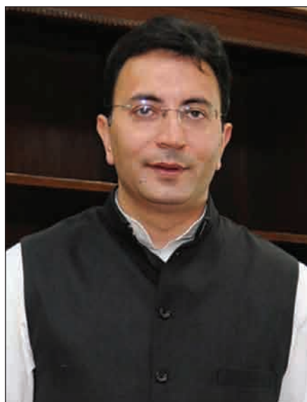
Shri Jitin Prasada Honorable Minister of State Human Resource Development Government of India