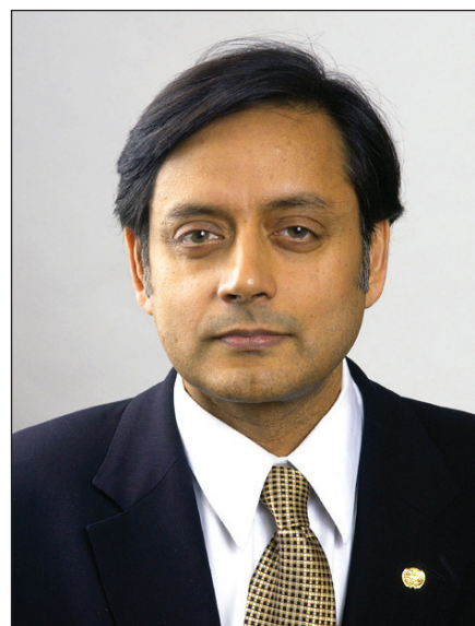
Dr. Shashi Tharoor Honorable Minister of State Human Resource Development Government of India