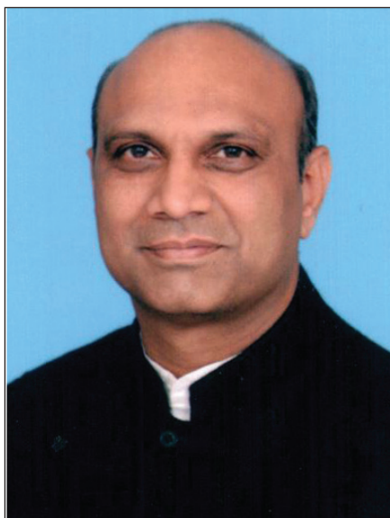
Dr. M. M. Pallam Raju Honorable Minister Human Resource Development Government of India and Chairman, IIT Council