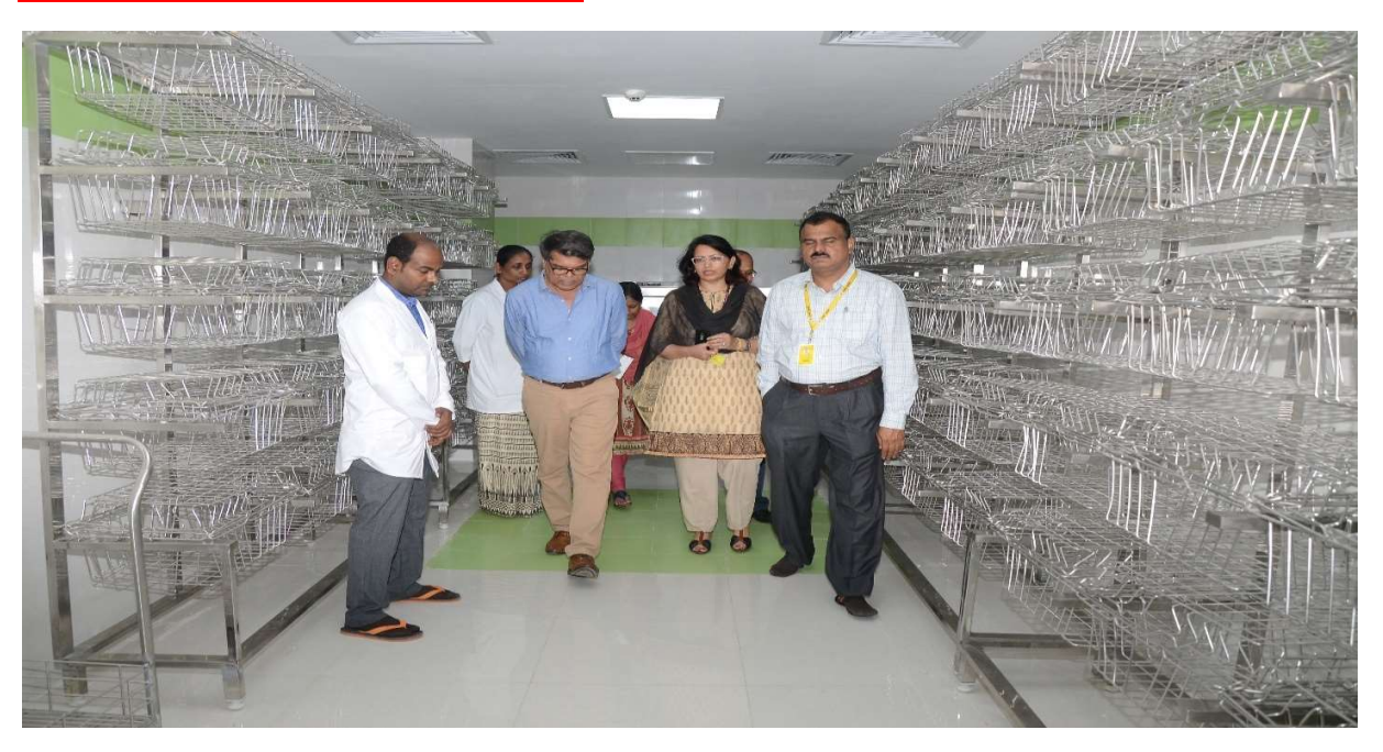
Joint Secretary MoHFW inspecting Brachytheraphy Console.