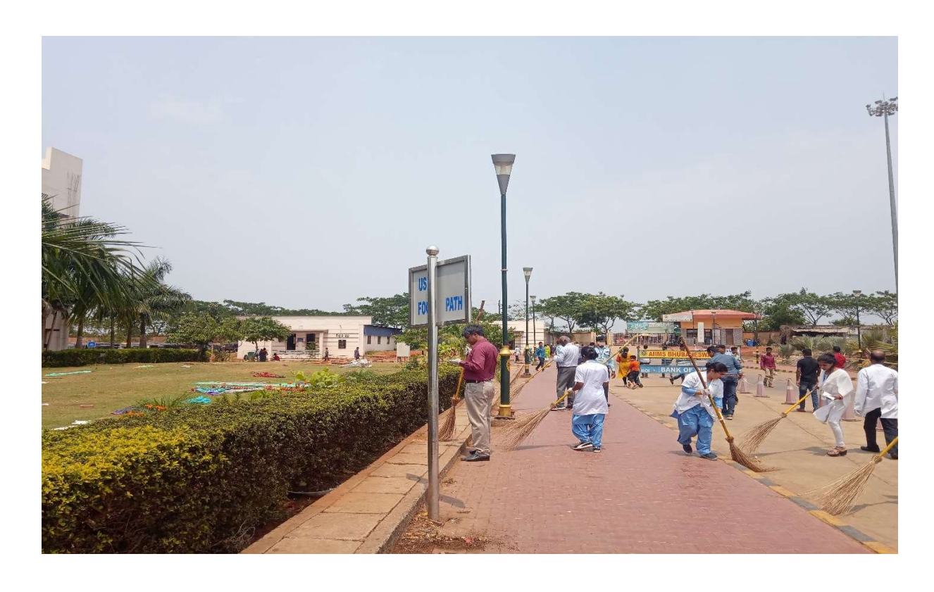
ALL INDIA INSTITUTE OF MEDICAL SCIENCES, BHUBANESWAR