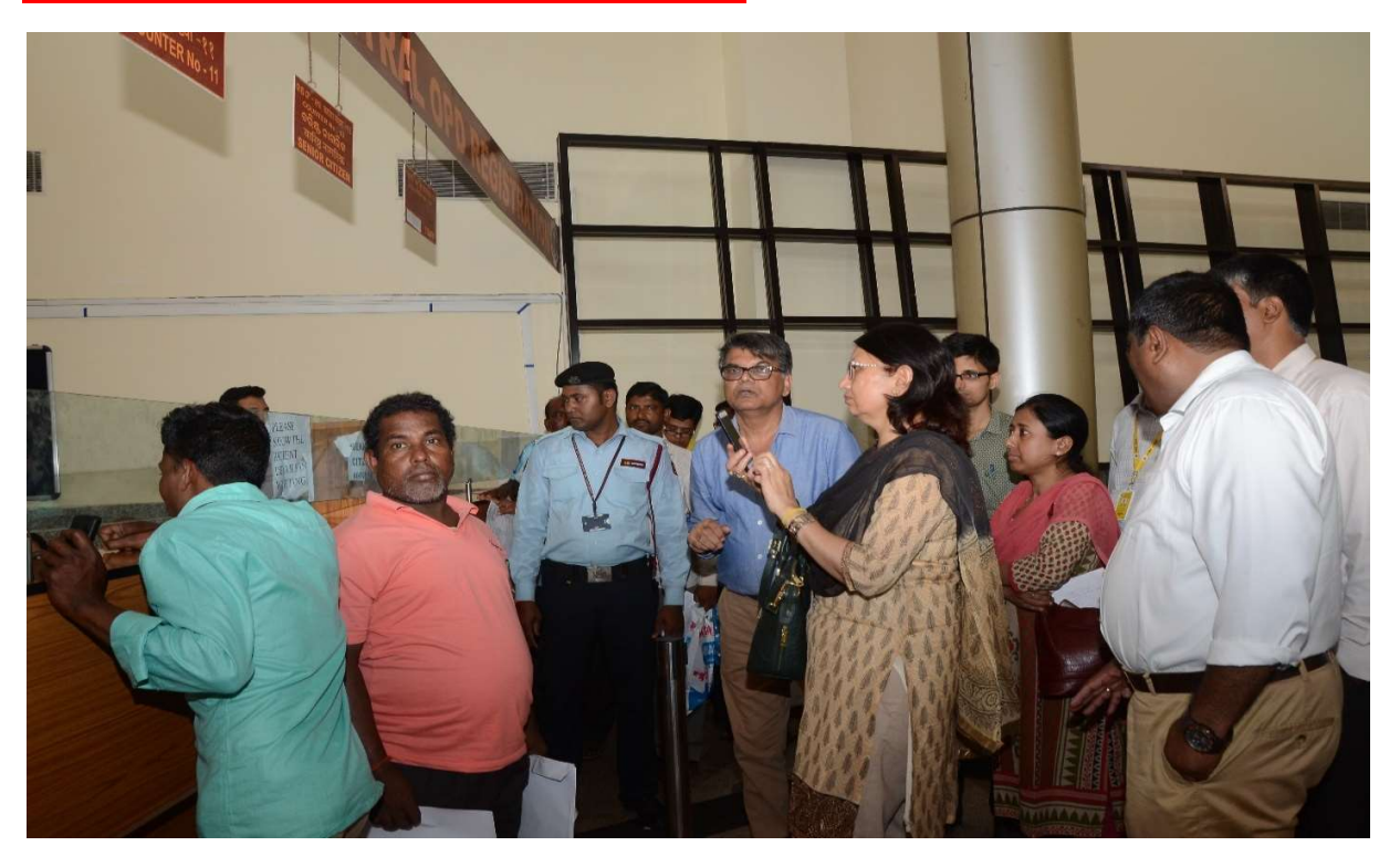
ALL INDIA INSTITUTE OF MEDICAL SCIENCES, BHUBANESWAR