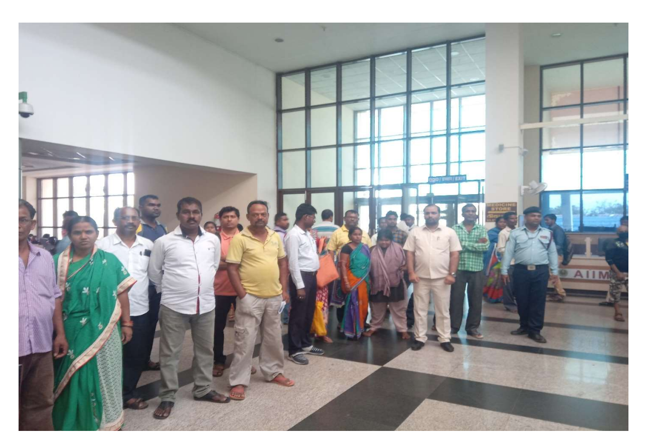
ALL INDIA INSTITUTE OF MEDICAL SCIENCES, BHUBANESWAR