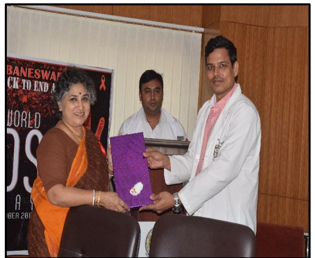
Felicitation and Prize Distribution