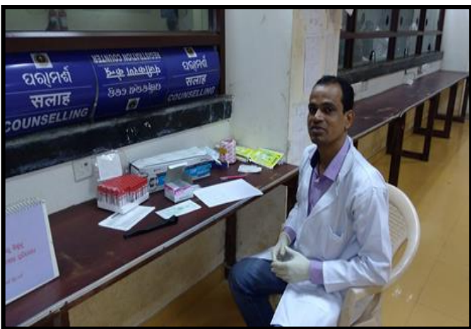
Voluntary testing for HIV