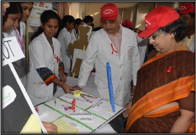
Poster and Exhibition Competition