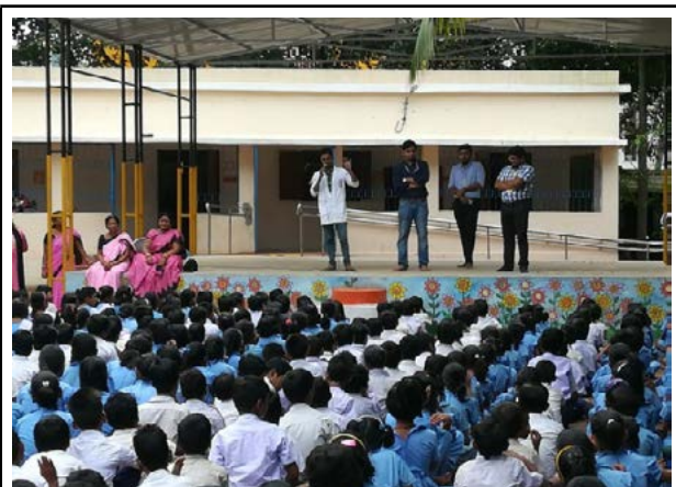
Interns under the guidance senior resident conducting Health education session in school