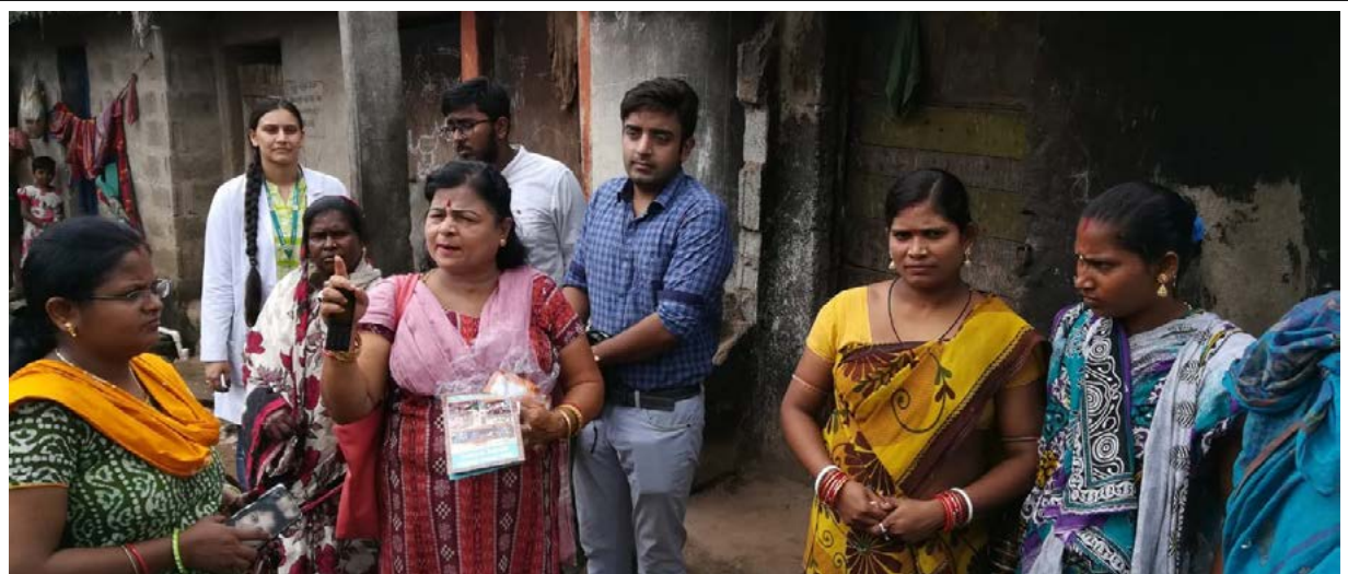
Residents and Interns along with staff of UHTC Nayapalli sensitising community about prevention of dengue