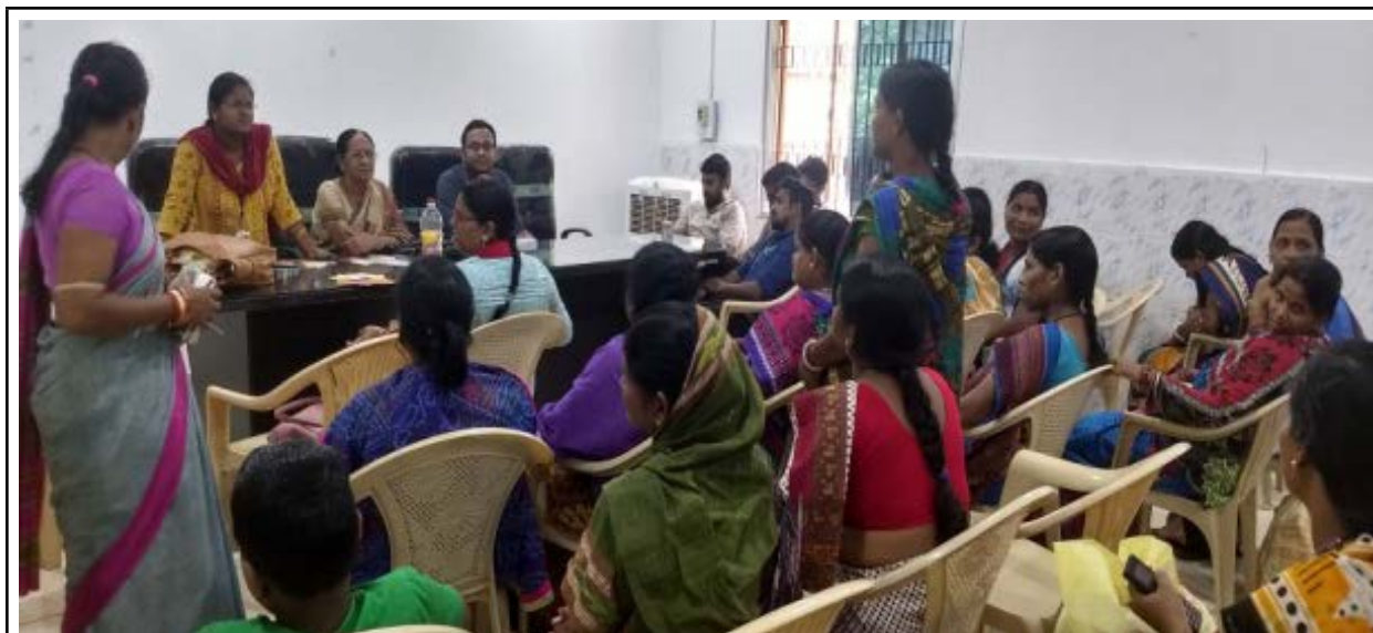
Training of ASHA and ANM for Mass drug administration for lymphatic filariasis