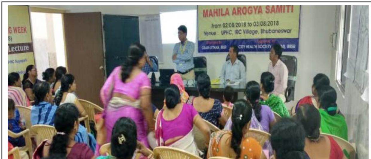
Interaction with Health workers during celebration of World breast feeding week